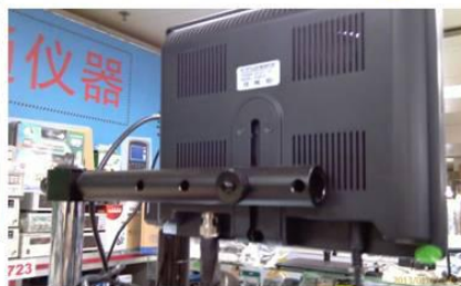
LCD DISPLAY REPLACEMENT OF OLD OBSOLETE CRT DISPLAY USED IN ASSEMBLY EQUIPMENTS (AVI, BNC, DIN) Note: Standard Notebook PC and microscope on display above, sold separately

Ref: SW Technology Pte Ltd, SXW China Electronics (Shenzhen) Co Ltd